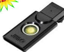
TRAC 12 Linear Lighting LED MODULE

ECM Product of the Year 2008 Category Winner